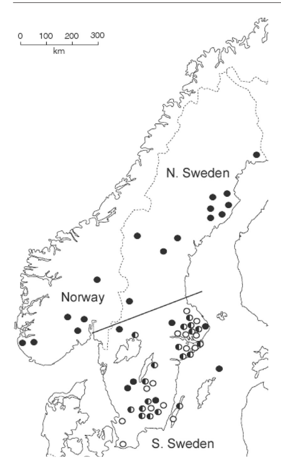
Fig. 1. Sample localities for mountain hares (filled circles) and brown hares (unfilled circles) are shown. The half-filled circles indicate localities where samples from both species and presumed hybrids were collected. The line separates South Sweden, where the two hare species occur in sympatry, and Norway/North Sweden, where only mountain hares occur.

hares in Sweden, locally up to 25% (Thulin & Tegelström 2002). The reciprocal transfer, resulting in mountain hares with brown hare mtDNA, has never been observed.