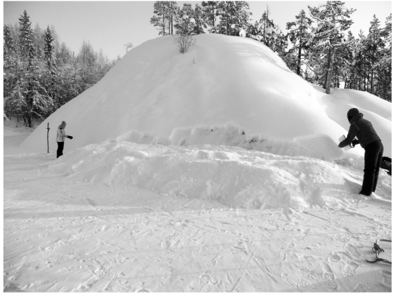
Fig. 1. A man-made snow-drift piled up at the breeding habitat of the Saimaa ringed seal. The drifts were on average 82 cm high, 802 cm long (parallel to shoreline) and 345 cm wide.