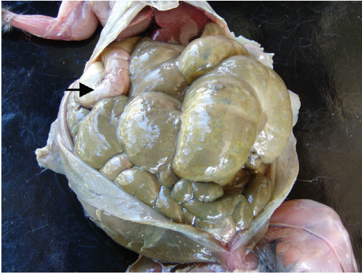
Fig. 1. Ventral overview of the gastrointestinal tract of Laonastes aenigmamus . The length of the cavity from the liver (top) to the pelvis is 12 cm. Arrow = pars pyloric .

Laonastes postcranial skeleton has been noted to be relatively unremarkable (Jenkins et al. 2005, Dawson et al. 2006, Huchon et al. 2007) but the jaws, masticatory musculature, and dentition are highly distinctive (Jenkins et al. 2005, Dawson et al. 2006, Hautier et al. 2011, Herrel et al. 2012). The mandible of Laonastes presents an intermediate association of features that could be considered neither sciurognathous nor as hystricognathous (Hautier et al. 2011). As compared with fetal crania and musculature, in adult Laonastes the rostral part of the skull elongates and the zygomaticomandibularis muscle develops disproportionately (Herrel et al. 2012).