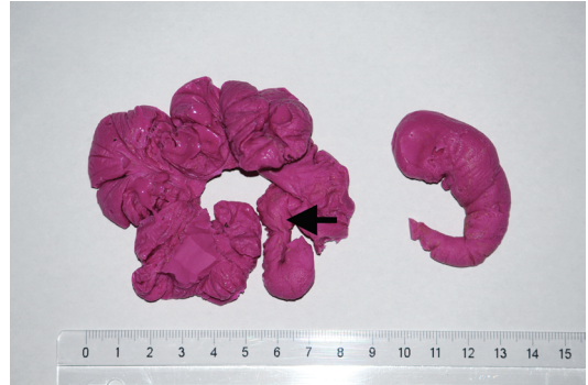
Fig. 2. Silicone cast of the stomach (left) and cecum (right) of L. aenigmamus (3M ESP, Express™2, Light Body Standard Quick VPS silicone impression material). Arrow = pars pyloric . Dorsal view, scale bar in centimeters.

Recent studies on the gastrointestinal tract of the Laotian rock rat Laonastes aenigmamus (Keovichit et al. 2011, Scopin et al. 2011) have revealed that these animals appear to digest plant fibre with macroscopically compartmentalized stomachs (Figs. 1 and 2) characterized by a dis-